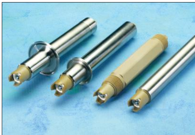
Sensor Mounting Configurations