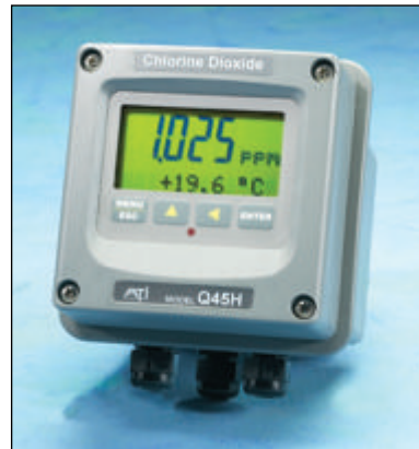
Chlorine Dioxide Monitor

The ATI Model Q45H/65 Residual Chlorine Dioxide system responds to chlorine dioxide with minimal interference from any residual chlorine that may be present.