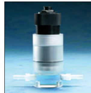
Low Volume Flowcell